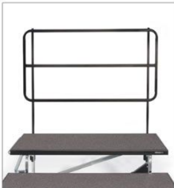
Step 1: Back Rails

Remove the installed back rails. Separate the riser unit from adjacent units.