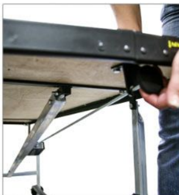
Step 5: Release Lock

Place right hand on the frame. Labels on the riser unit show recommended placement.