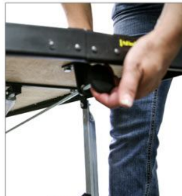
Step 3: Grasp Frame

Place right foot under the wheel bracket to prevent the unit from sliding.