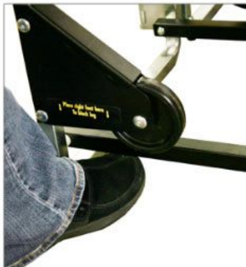
Step 2: Secure Sliding

Remove the installed back rails. Separate the riser unit from adjacent units.