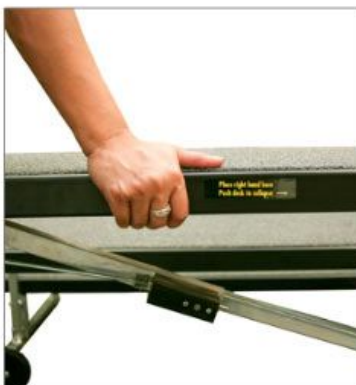
Step 4: Grasp Frame

Grasp the lock release, located under the left end of the top deck (3rd level), with the fingers of your left hand.