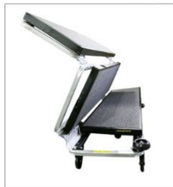
Step 6: Fold Together

While pulling out on the lock release, push the deck toward the right with your right hand until the unit folds to the floor.